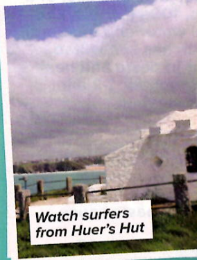
Watch surfers from Huer's Hut